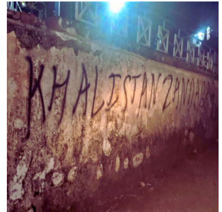
Wall of govt office in Dharamshala