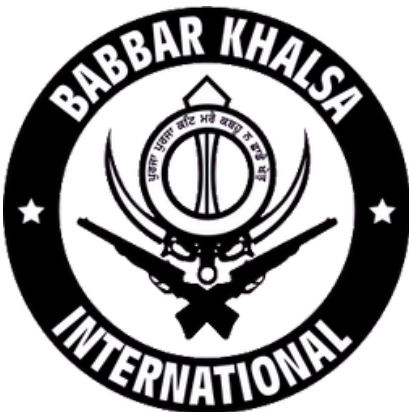
Babbar Khalsa Group