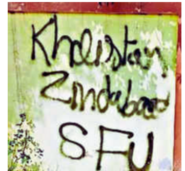
Pro-Khalistan slogans on walls in Rajasthan's Hanumangarh