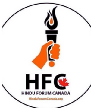
Hindu group in Canada