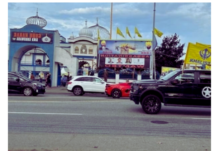
Posters calling for assassination of Indian Diplomats resurfaced in Surrey, Canada