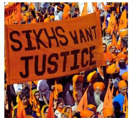
Sikhs For Justice