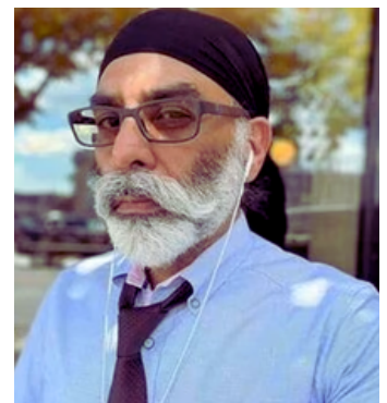
SFJ Founder Gurpatwant Singh Pannun