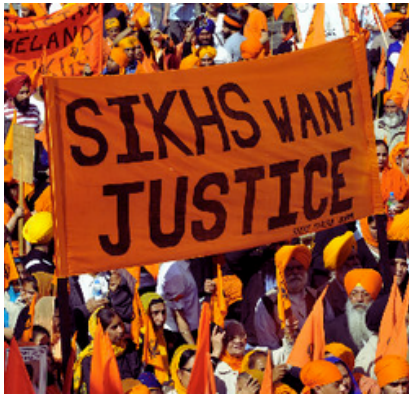
Sikhs for Justice