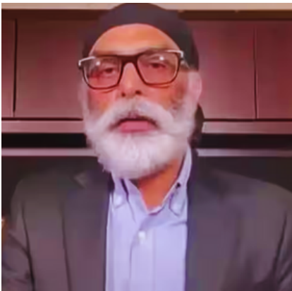
Gurpatwant Singh Pannun