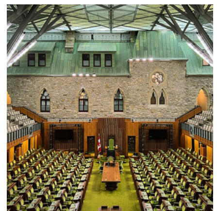
House of Commons of Canada