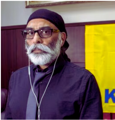
Gurpatwant Singh Pannun