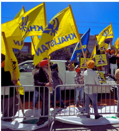
Sikhs For Justice