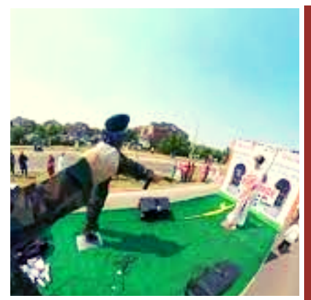
Tableau depicting Indira Gandhi's Assassination