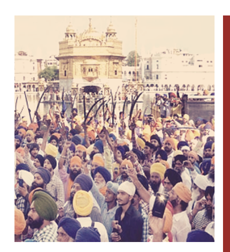
Pro-Khalistan slogans raised at Golden Temple