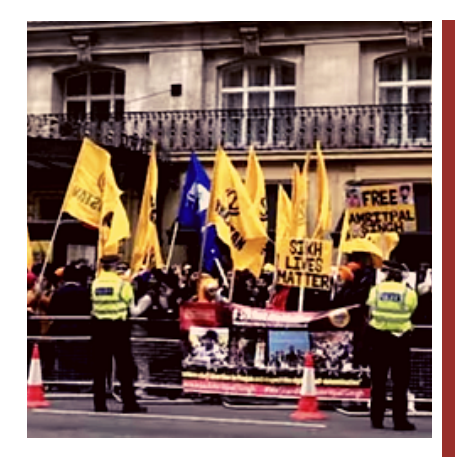
Attack on Indian High Commission in Canada