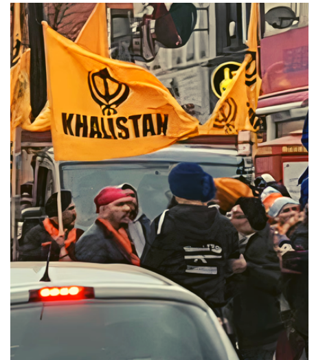
Khalistani terrorists set up operational base in Portugal