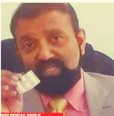
UK lawyers 'coaching' illegal Indian migrants to fake asylum