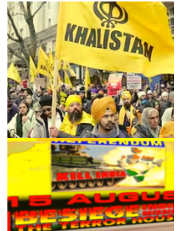
SFJ announces Global 'Besiege Indian Missions'