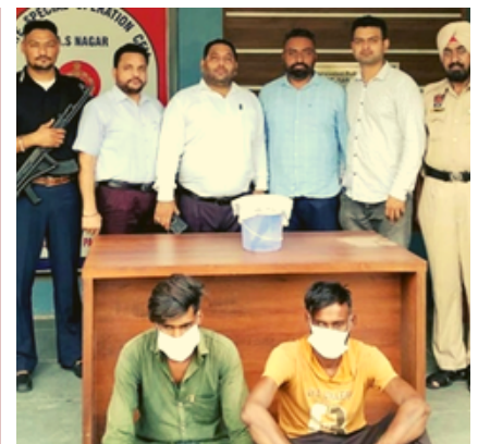
Punjab Police neutralizes Khalistan Liberation Force backed terrorist module