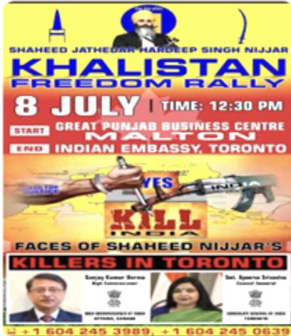
'Kill India' poster for 'Khalistan Freedom Rally'