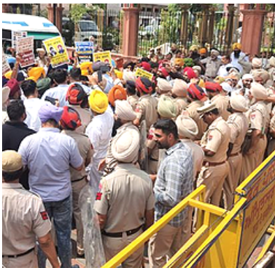
Dal Khalsa activists heading to the office of India's external intelligence agency, Research and Analysis Wing (RAW)