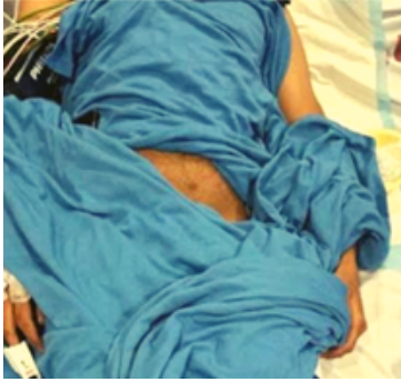
Indian student attacked with iron rods by Khalistan supporters in Australia