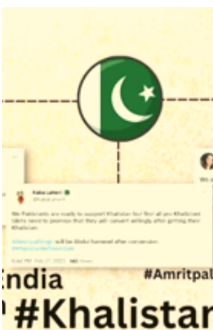
Bots on social media to amplify violence