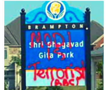
Shri Bhagavad Gita Park in Brampton, in the Greater Toronto Area