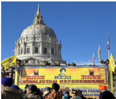
Khalistan Referendum held in San Francisco, US