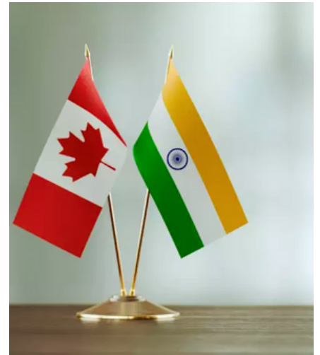
Police see rise in extortion cases targeting Indo-Canadian businesses