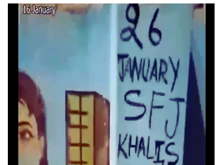
Slogans supporting Khalistan surface in Delhi ahead of Republic Day