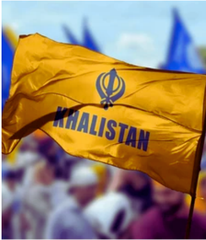
Khalistanis using RBI's money transfer service to fund terror