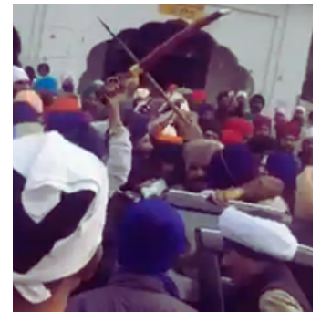
Clash at Tarn Taran gurdwara over removal of Bhindranwale's poster