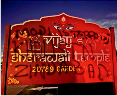
Hindu temple defaced with pro-Khalistan graffiti in California