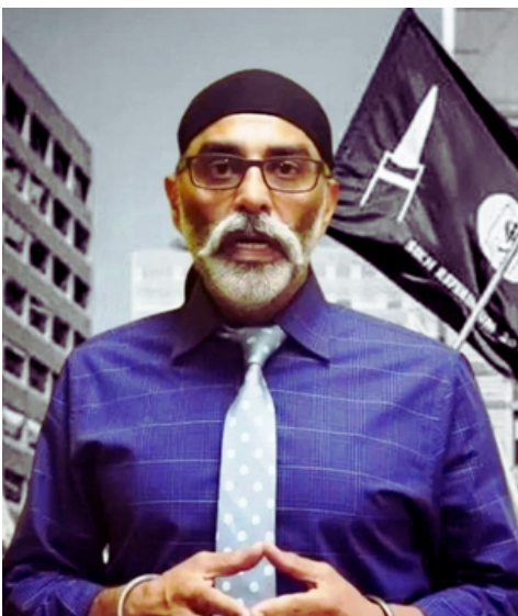
Gurpatwant Singh Pannun