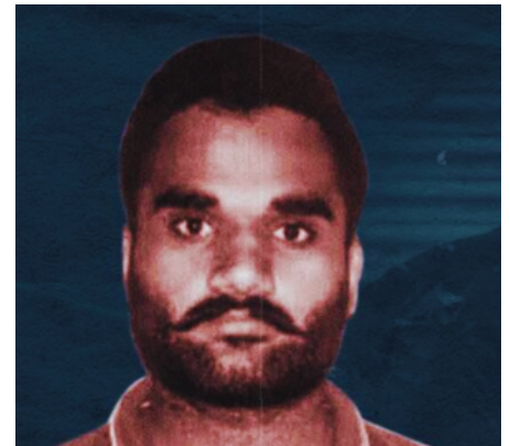
Gangster Goldy Brar