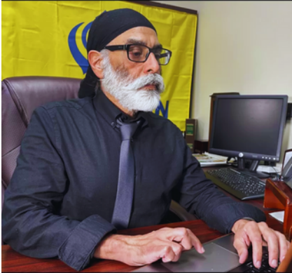
Gurpatwant Pannun's latest threat