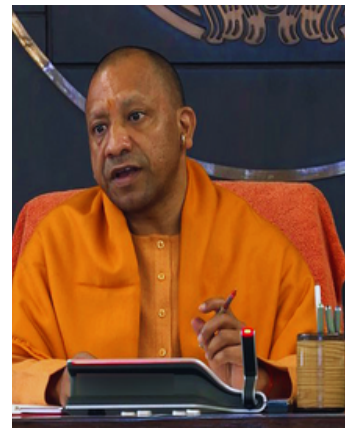
UP Chief Minister Yogi Adityanath