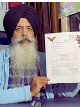
Dal Khalsa writes to French President prior to his visit to India