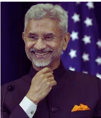
Foreign minister Jaishankar