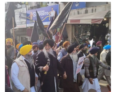
Dal Khalsa marked a black day in Moga