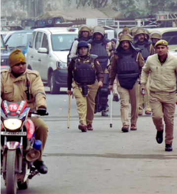
UP ATS arrests three aides of Khalistani leader Pannun from Ayodhya