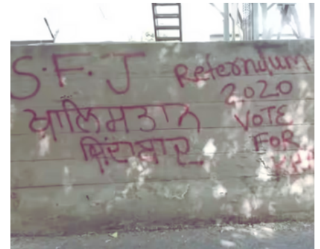
Pro-Khalistan slogans near Mata Chintpurni Temple in Himachal Pradesh's Una