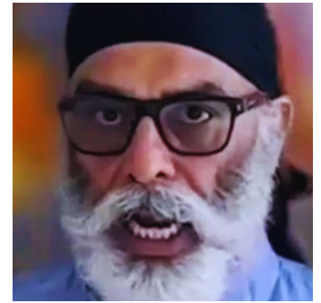
Gurpatwant Singh Pannun