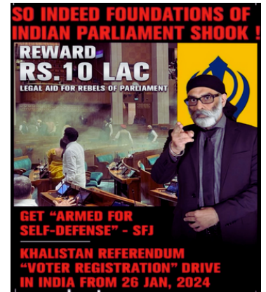
Rs 10 lakh legal aid