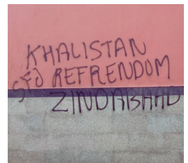
Pro-Khalistani graffiti painted near Delhi metro station