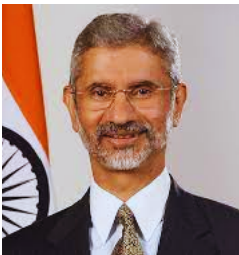
India's External Affairs Minister (EAM) S. Jaishankar