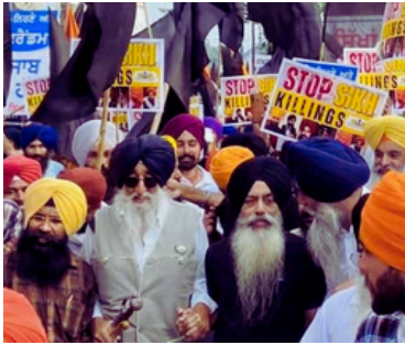
Dal Khalsa led protest