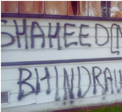
Pro-Khalistan graffiti in US