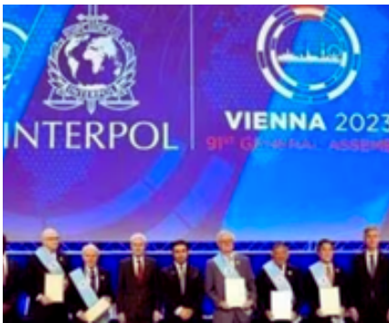
General Assembly of Interpol