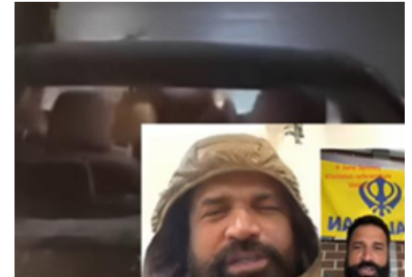
Khalistani supporter beaten by Indian youths in Australia for insulting Hindus and their Gods