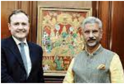
Minister of State for Security, United Kingdom Thomas Georg John Tugendhat with India's External Affairs Minister, S Jaishankar