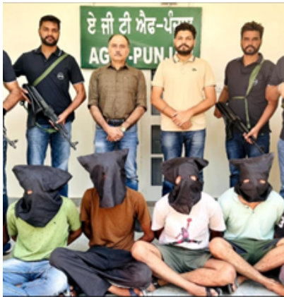
Punjab Police arrests six Pakistan based operatives