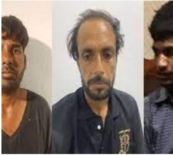
Punjab 'smugglers' detained by Pakistan Army