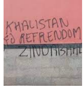
Delhi Metro stations defaced with 'Khalistan Zindabad' graffiti ahead of G20 Summit