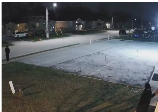
Hindu Temple Vandalised in Ontario, Canada