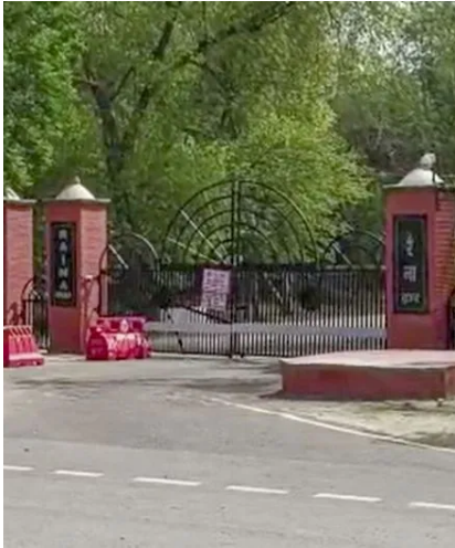
Bhatinda Military Station