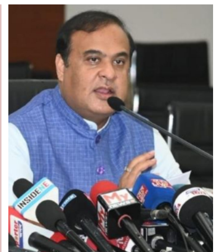
Assam Chief Minister Himanta Biswa Sarma