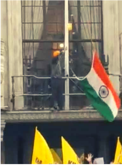
Violent incident at the Indian High Commission in London on 19th March 2023