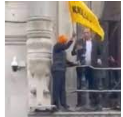
Pro Khalistani Supporters at Indian Mission