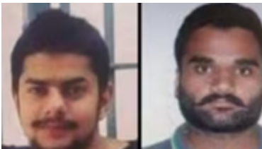
Prominent gangsters currently located abroad