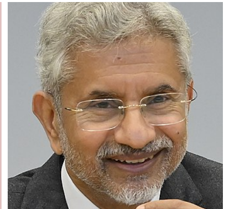
External Affairs Minister S. Jaishankar